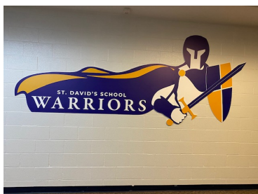
Warrior Logo between gyms