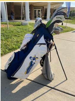
New Golf Bags for the team