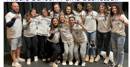
Varsity Girls Basketball