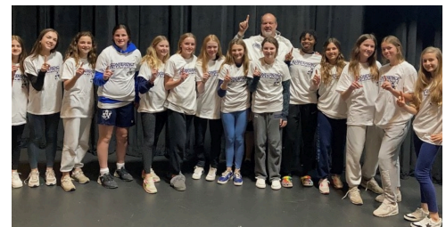
Middle School A Girls Basketball